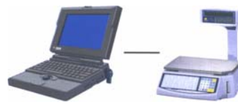
PC to Scale Interface

Using a state-of-the-art high speed 100mm/sec (4"/sec) durable thermal print head, the LS-100 was built with the most demanding "prepack" applications in mind. With our innovative cassette drawer mechanism, the LS-100 can be loaded with labels quickly & easily. With a larger label roll capacity than most printing scales, the LS-100 allows for the most productivity with minimal down-time. We combined all these great features with an extensive Label Format Library® containing the most popular label formats as well as many of our own custom label styles. With this much flexibility, the LS-100 can be easily adapted to replace any scale without having to change your current label stock! And with display & printer support for many languages (English, Korean, Spanish...) combined with support for ingredients, safe handling, By-weight, By-count, or even simple label printing, you can never go wrong with the LS-100!