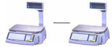
Scale to Scale Interface