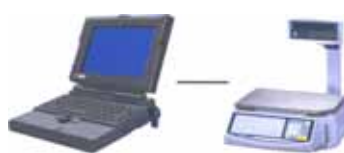
PC to Scale Interface Serial or Ethernet

Using a state-of-the-art high speed 100mm/sec (4"/sec) durable thermal print head, the LS-100N was built with the most demanding "prepack" applications in mind. With our innovative cassette drawer mechanism, the LS-100N can be loaded with labels quickly & easily. With a larger label roll capacity than most printing scales, the LS-100N allows for the most productivity with minimal down-time. We combined all these great features with an extensive Label Format Library ® containing the most popular label formats as well as many of our own custom label styles. With this much flexibility, the LS-100N can be easily adapted to replace any scale without having to change your current label stock! You can even design up to 16 of your own custom label formats! With display & printer support for many languages (English, Korean, Spanish...) and ingredients, safe handling, By-weight, By-count, or even simple label printing, you can never go wrong with the LS-100N!