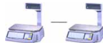
Scale to Scale Interface And TCP/IP Networking